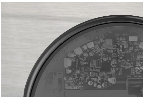
16 Types of Sensors