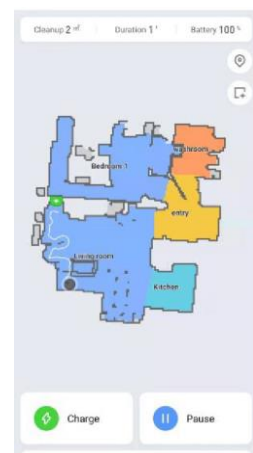
Mobile App Control