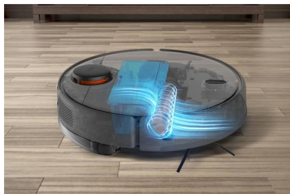
3000Pa Powerful Suction