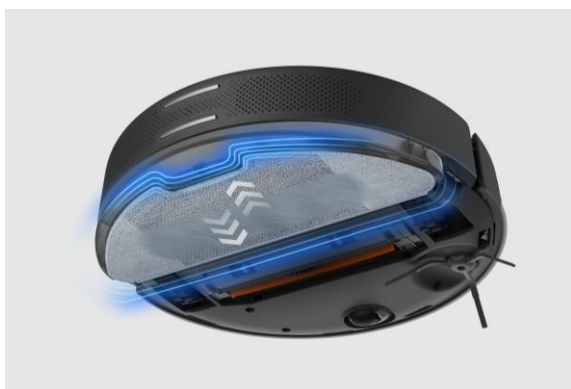
High-frequency sonic vibration mopping