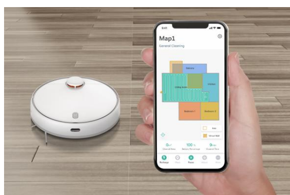
Mi Home/Xiaomi Home App Control