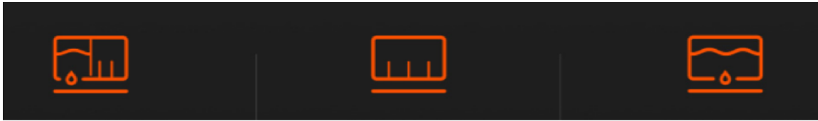
Sweep & Mop