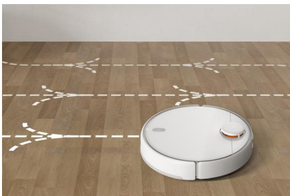
Mop:simulate artificial mopping,scrub