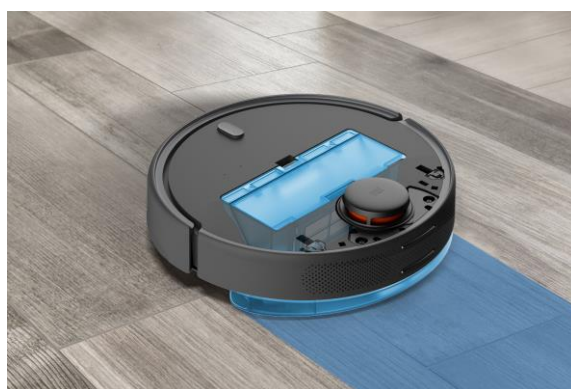
Removable High-capacity Dust Compartment & Water Tank