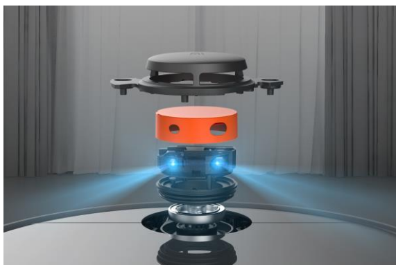
Updated LDS Navigation System